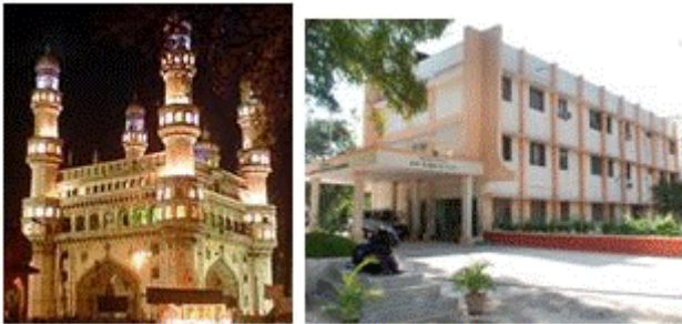
Charminar and 'Pashu Bhavan'